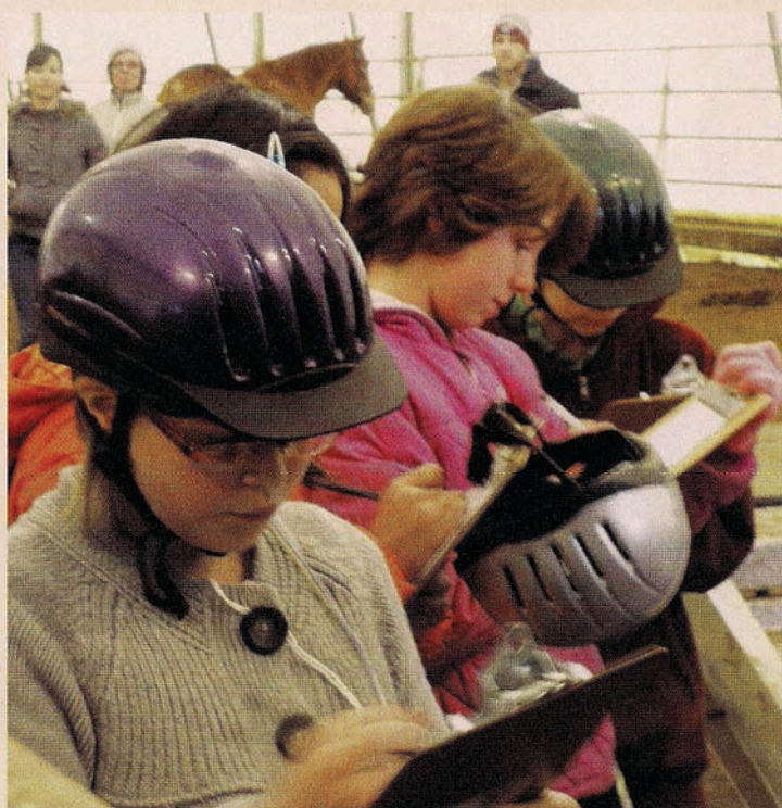
Participants in the study complete surveys for the project.

hands-on program training with horses and child actors, videos and slide presentations. They were also trained in the program's theoretical rationale and principles of cognitive behavioral counseling and child development. Since the study was conducted as an after-school activity, it was also implemented in close collaboration with school administrators and staff.