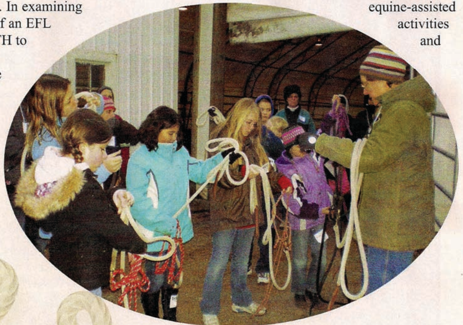
Participants learn how to properly tie halters in a study of the effectiveness of EFL, funded by the National Institutes of Health at Washington State University.

that participation in equine-assisted activities and